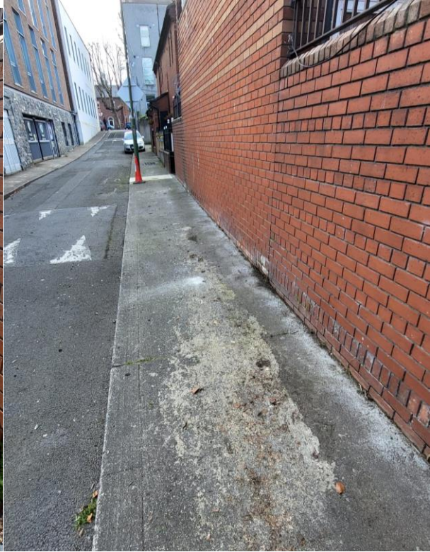
Saint Margaret's Avenue